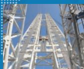
Cranes/ Lifting Equipment